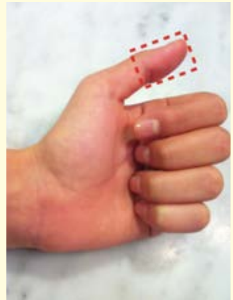
About 1 teaspoon