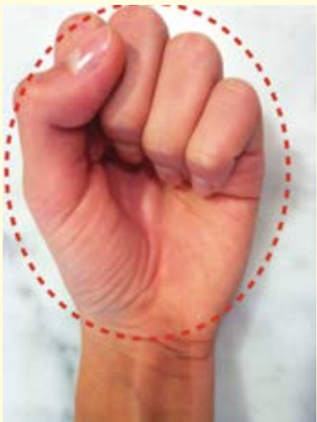
About 1 cup