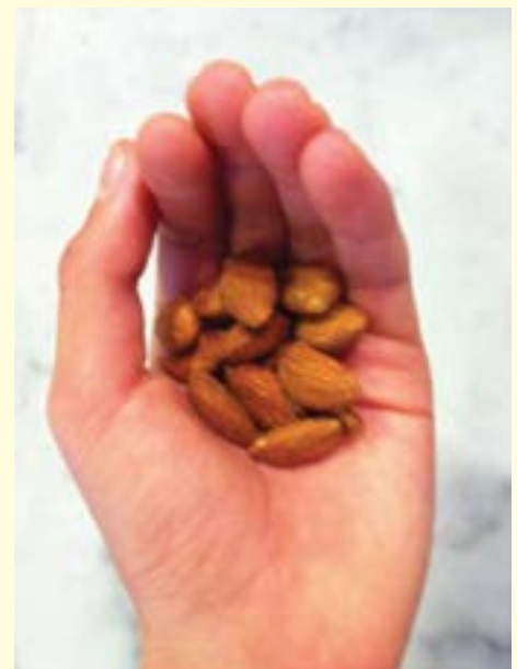
About 1/4 cup