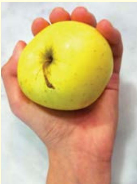
1 serving of fruit